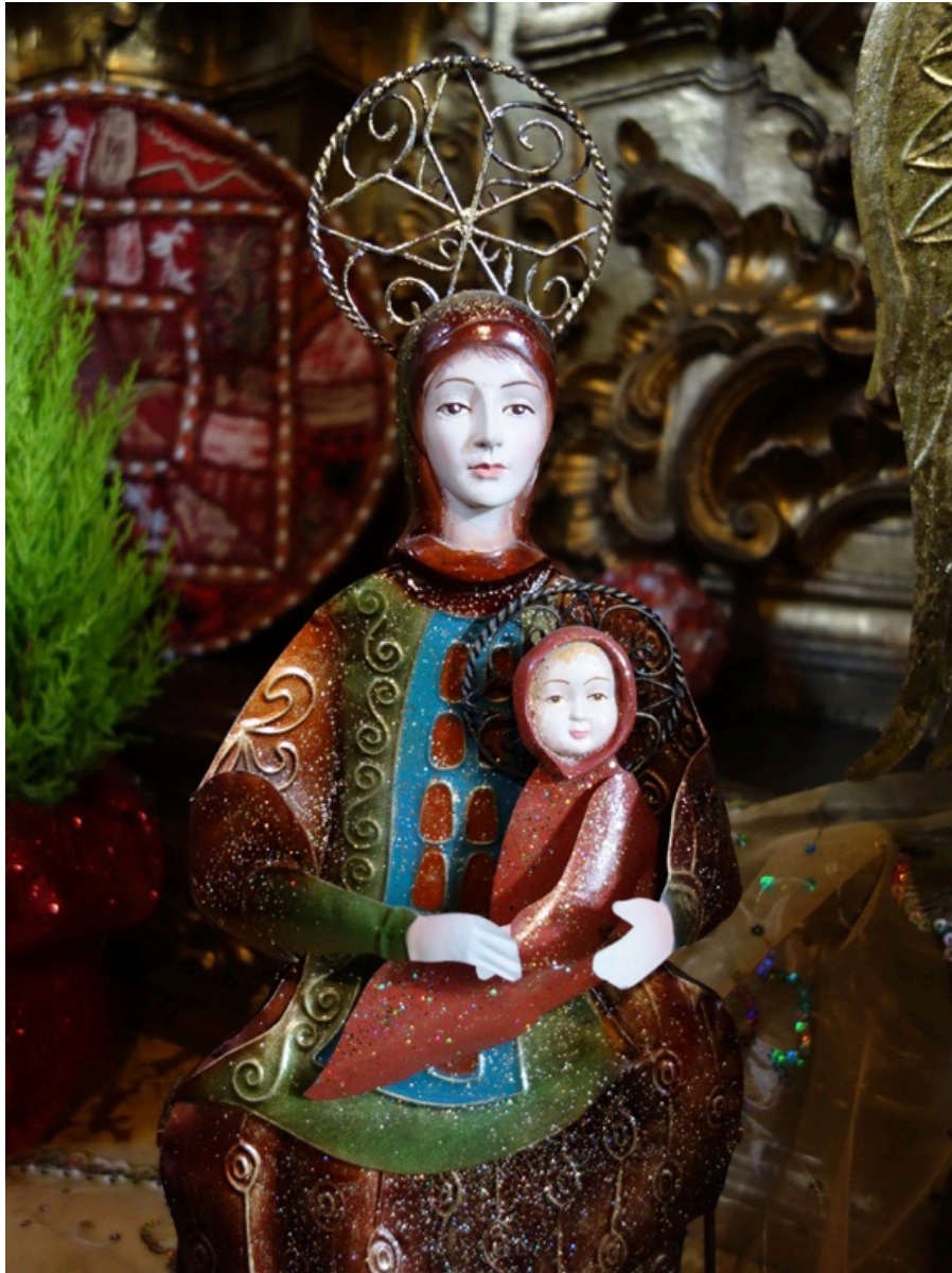
Mother of Might